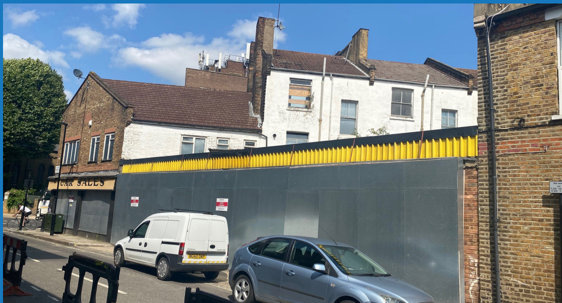
Existing view of the site from St John's Terrace