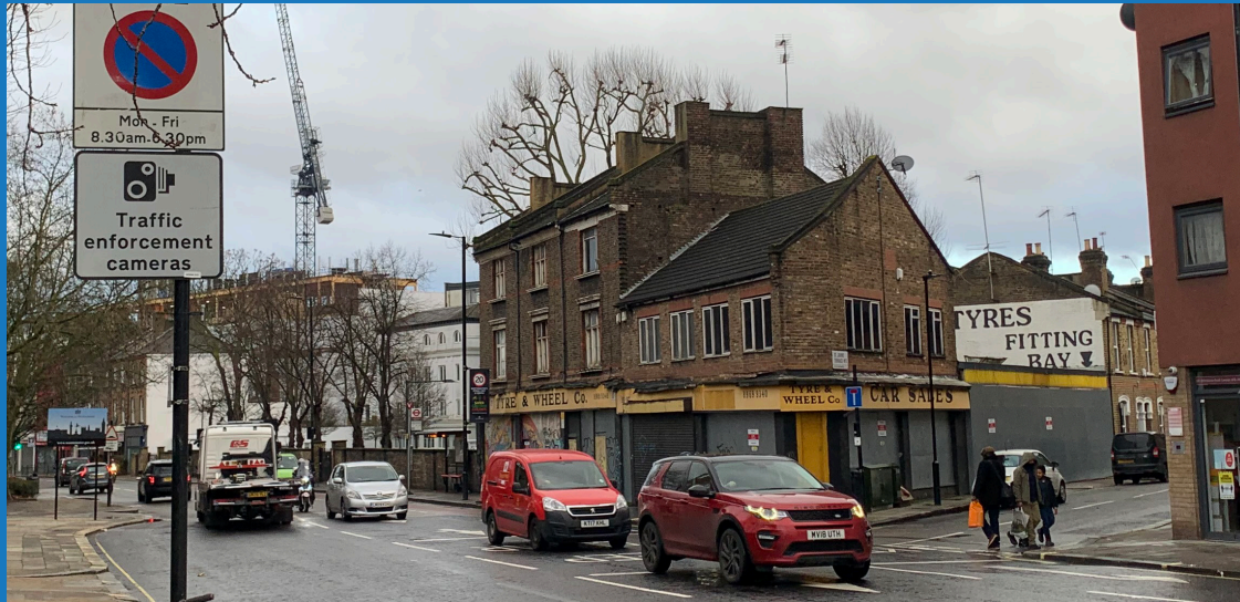
Existing view of the site from Harrow Road